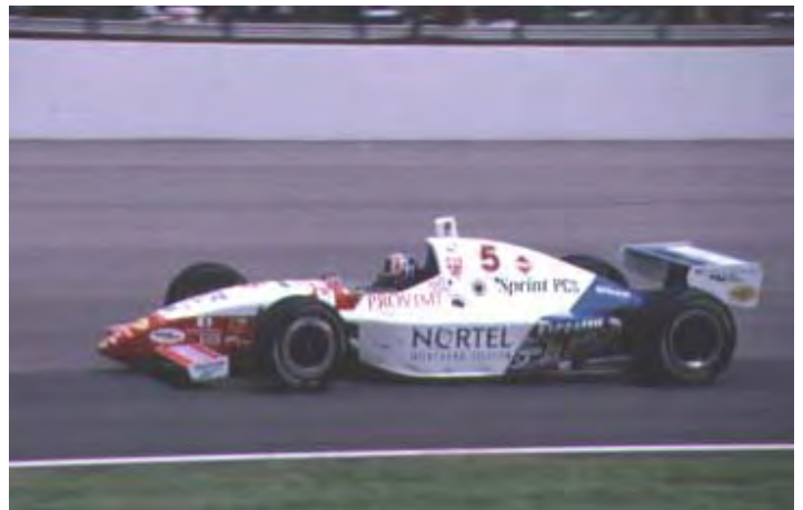
Indy 500 winner, Treadway Racing's car driven by Arie Luyendyk using Kinsler manifold, filters, p.r. valve

Used an EPROM chip that had to be 'burned' outside of the ECU with hexadecimal code, then installed in the unit. It did have the luxury of having trim knobs for some field adjusting.