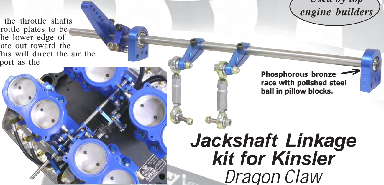
Jackshaft linkage kit installed on Dragon Claw manifold

Easy to set up and gives each shaft the exact same rotation. See Page #62, 63.