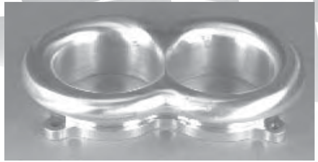
Radiused double inlet plate