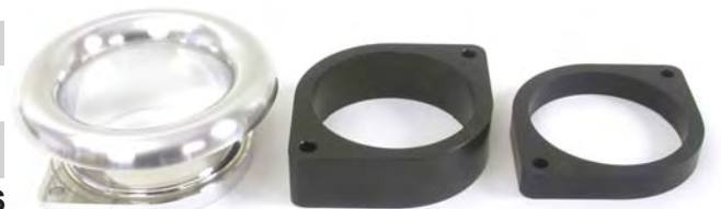
#7873 Radiused single inlet plate #7984 Spacer #7945 Spacer