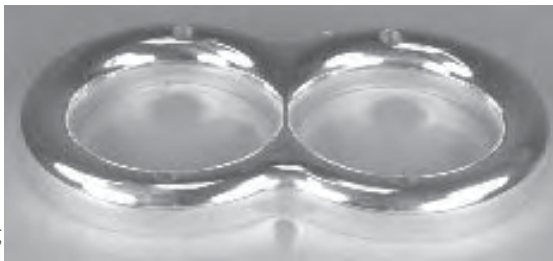
Ultra short style, bolts through radii

Fit all Kinsler big block Chev manifolds: Standard one-piece rectangular port, three piece Dart Big-Chief, Pontiac Pro-Stock, and EPD. Has the same 4-bolt pattern and bore centers as the Kinsler big block Chev manifold. Billet aluminum, .750" overall height.