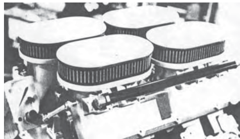
Air cleaner adapters installed on Kinsler Pontiac Pro-Stock injection manifold with EFI for street use