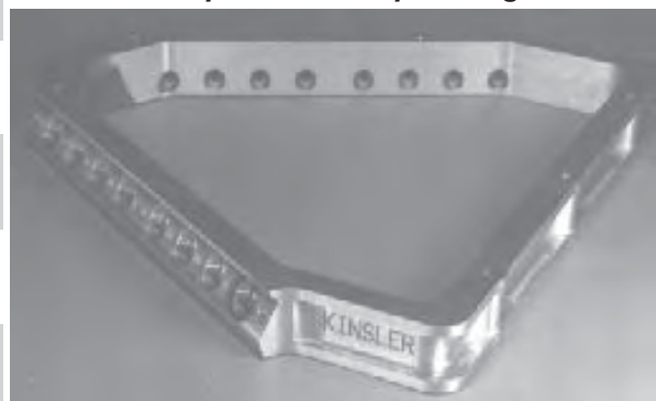
Open style EFI adapter to go under PSI® supercharger