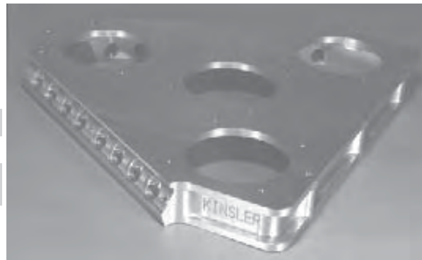
Throttle body adapter to go on top of PSI® supercharger