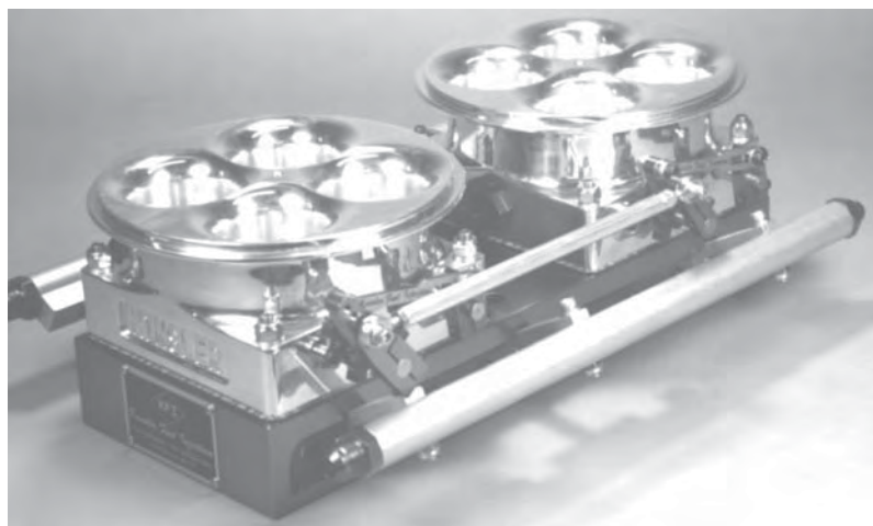
Dual four-barrel adapter #16952 with two Kinsler High-Flow 4-barrel throttle bodies (see Page #43 ) and extruded aluminum fuel rails

* Kits include mounting stanchions, hardware, and AN fittings