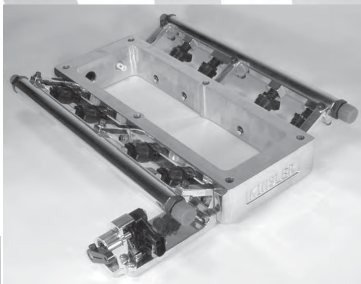
Open style adapter #16951, fuel rails, 8 injectors, remote TPS adapter

Billet 6061 aluminum, "show-quality polished". Custom color anodizing available. Standard 6-71 GMC bolt pattern or 14-71 bolt pattern. Custom made units are available.