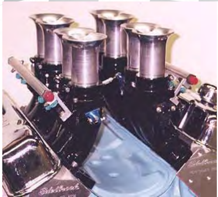
Front view with Kinsler aluminum EFI fuel rails