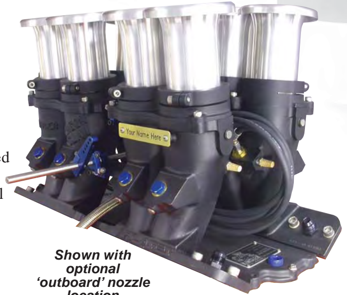
Shown with optional 'outboard' nozzle location