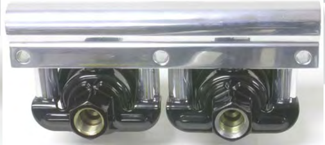
Dual pressure relief valve adapter shown with polished finish