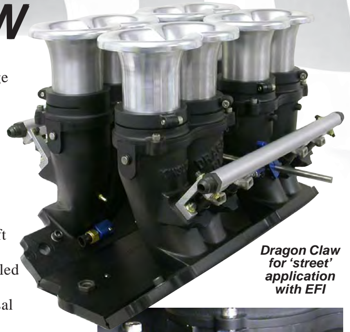
Dragon Claw for 'street' application with EFI