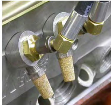
Nozzle lines with 45 degree ends and aluminum banjos with air filters for 'down' nozzles in cylinder head