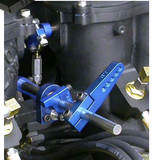
2-piece adjustable pulling arm included with Jackshaft linkage kit