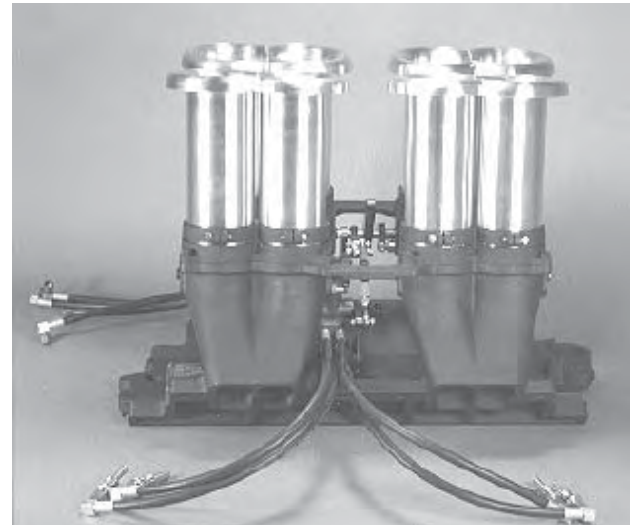
'XTRA-LIGHT' 2 5/8" throttle size manifold, nozzle bosses removed from castings, optional port profile- All Pro 285 stage II