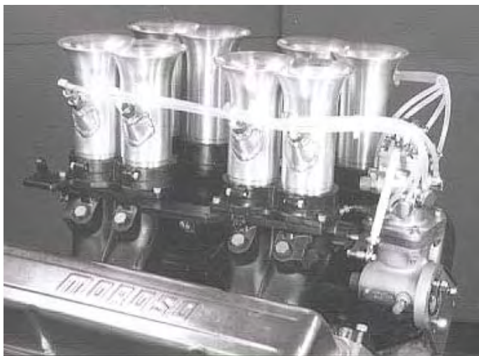
Small block Chevy manifold with Lucas Mechanical fuel injection, note the nozzle bosses in ramtubes, see Page # 54