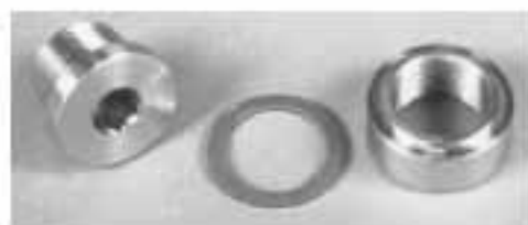
#10676 Bung has pilot for positioning in the exhaust tubing for welding