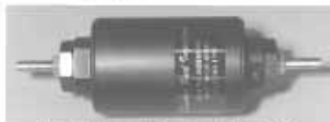
10905 Signal Damper with 3/16" barbed fittings