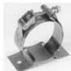
#12328 Mounting bracket