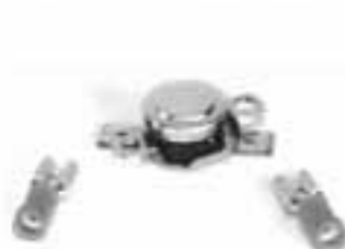
#12329 Thermal switch