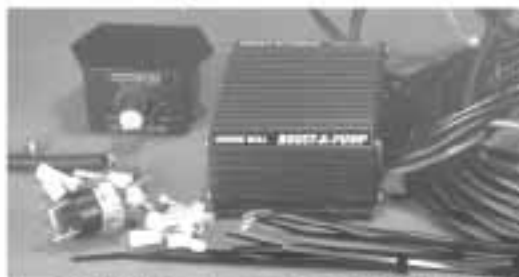
SHOWN IS #10237 BOOST A PUMP KIT