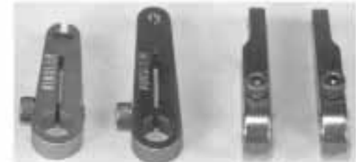
#5575 #5493 #5588 #5589