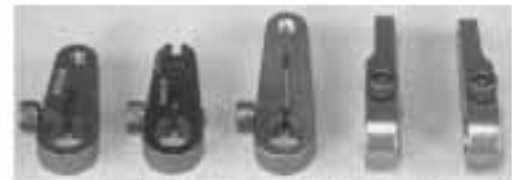
#5572 #5571 #5490 #5582 #5583