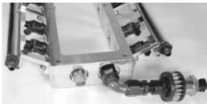
Optional idle air control motor and remote housing #10662, see Page 64-M