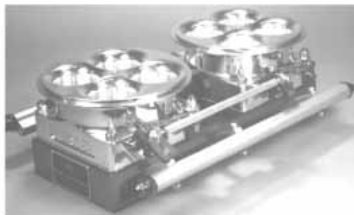
Dual Four Barrel Adapter #16952 with two Kinsler High-Flow 4-barrel throttle bodies and extruded aluminum fuel rails, see Page 15-M

* Kits include mounting stanchions, hardware, and AN fittings