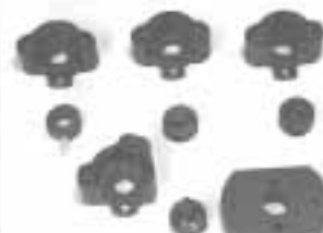
Several Types of TPS Adapters