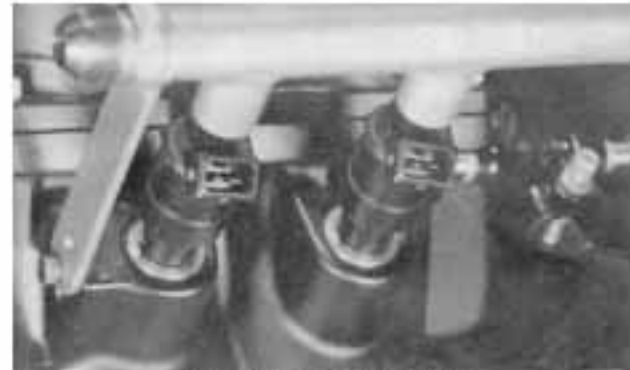
Stainless Steel Fuel Rail