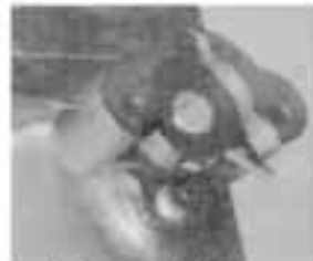
Boss and driver installed

We can machine any end of our manifolds to accept our universal bolt-on TPS adapter. We have adapters for most types of sensors. We also offer a remote sensor mount, which uses a hex rod linkage assembly for actuation, see Page 51-M . Excellent to install a TPS on any application.