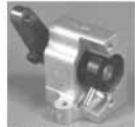
#7086 Kinsler remote TPS mount assembly

C) Vacuum Ports We can drill and tap the runners and supply plumbing and a junction block for vacuum modulated metering, vacuum accessories, or a remote idle air control motor housing. We have the remote housings and idle air motors, see Page 64-M .