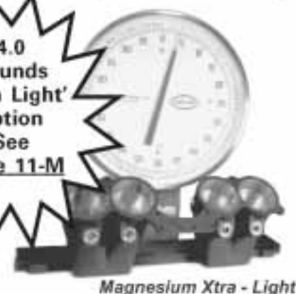
Magnesium Xtra - Light

4.0 Pounds 'Xtra Light' option See Page 11-M