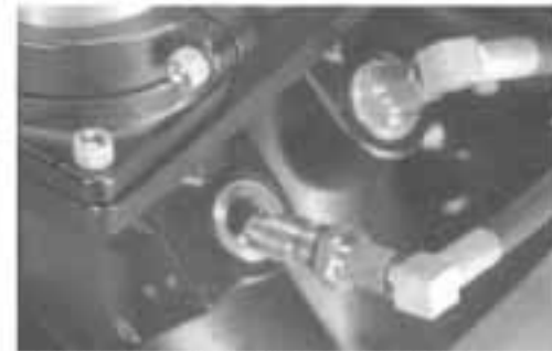
1/2-20 Thread Brass Inserts For Constant Flow Nozzles

8) Universal Nozzle Bosses Most Kinsler manifolds are available with bosses that are tapped 13/16-16. These accept our adapter inserts to accommodate any type of nozzle/injector, (i.e. constant flow, EFI, Lucas, etc.). To change from one type of nozzle or injector to another, simply remove the old inserts and install a new set. We also have dual bosses available on some of our units, and bolt-on bosses to go on the runners of any other brand or type of manifold.