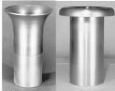
Traditional Bell 180°

7) Ramtubes Our ramtubes are made from high quality aluminum to resist denting while maintaining their light weight. While this is more costly, they are truly a superior piece. If our 180° are shortened, they will slip into our adapters without having to turn the outside diameter, as they are made with the proper diameter all the way up the tube. If our traditional ramtubes are shortened, they must have the base remachined to fit the adapters, Part# 7898, see Ramtubes Page 27-M .